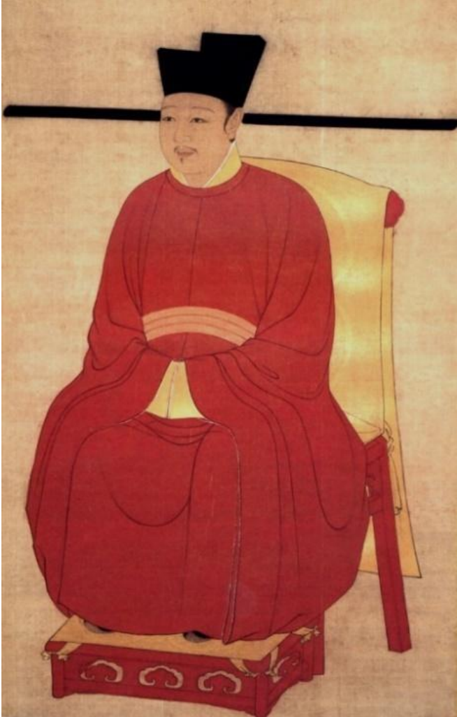
Unknown Song dynasty artist – the Emperor Huizong

You need a line brush that will create fine, dynamic lines in a size suitable for the painting you are working on and suitable wash brushes to add the wash work. For small scale subjects, these will be small brushes and for larger scale subjects these will be larger brushes. Your line work needs to be scaled to the size of the subject of your painting and to the level of detail required.